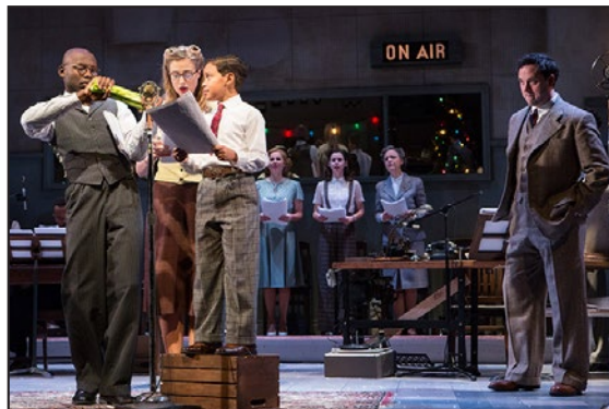
Soul Pepper It's A Wonderful Life