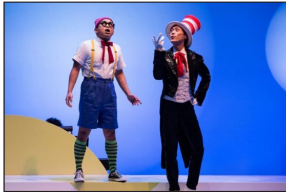
Young People's Theatre Seussical

Soul Pepper generously donated tickets to bring 22 community members to the Bluma Appel Theatre at the St Lawrence Centre for the Arts to see It's A Wonderful Life . This cherished holiday classic was reimaged as a 1940s live-radio broadcast and all scripts and sounds were created on stage by a Soul Pepper ensemble.