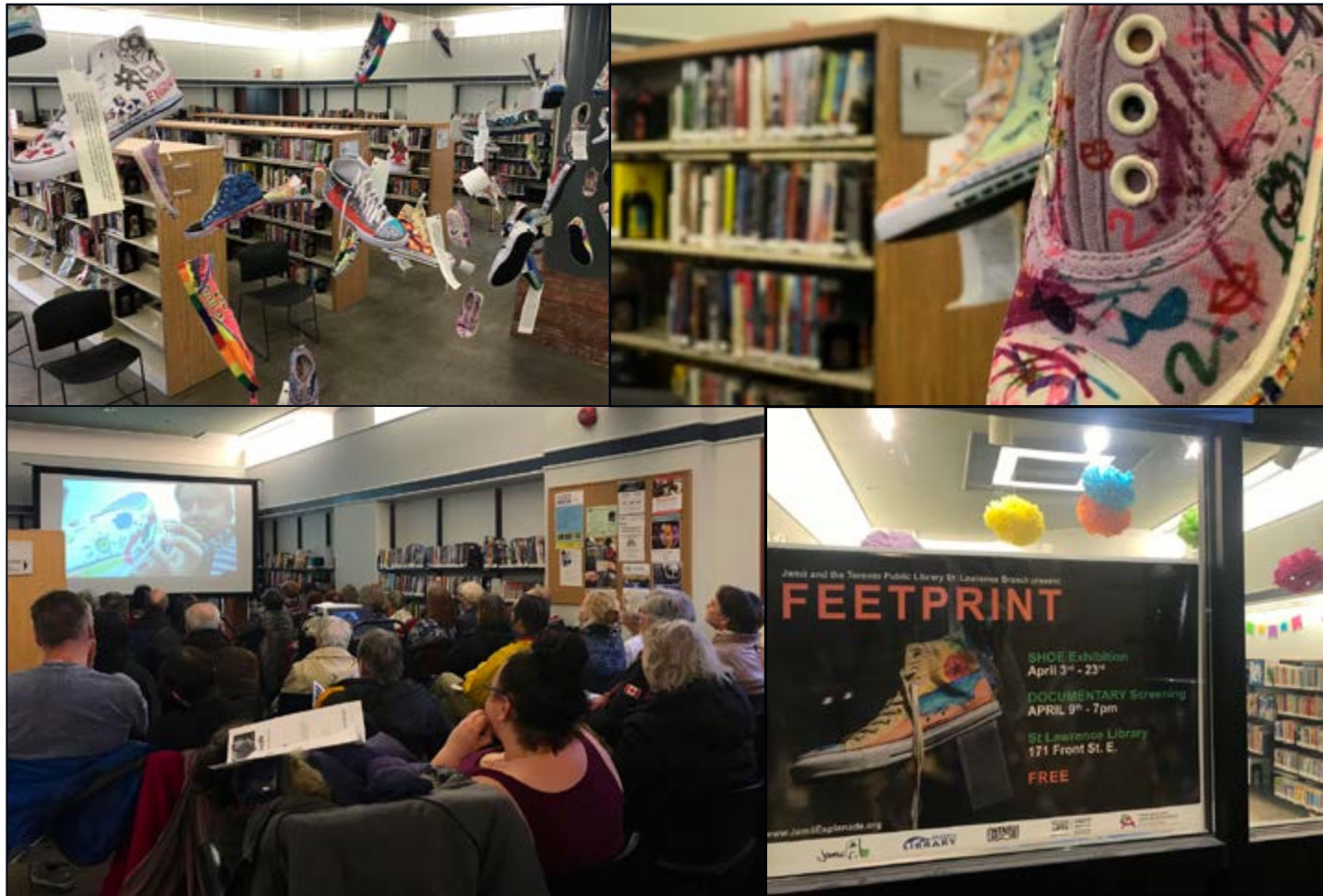
Exhibit viewers: 300+